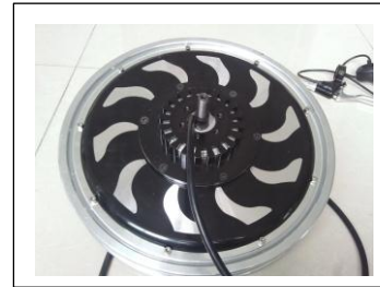
Magic pie 3 motor