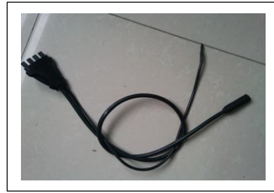
connection wire(8pins wire)