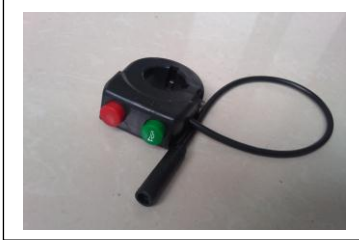
cruise control button/horn